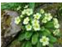
Welcome sights on the 1st April

Your suggestions for talks and events next winter are welcomed, please phone or E-mail a group member listed below or tell us at one of the meetings listed above.