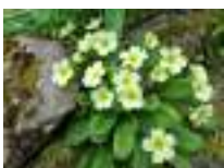
Welcome sights on the 1st April

Your suggestions for talks and events next winter are welcomed, please phone or E-mail a group member listed below or tell us at one of the meetings listed above.